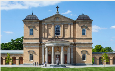
Interior and exterior of award-winning Christ Chapel, Hillsdale, Michigan