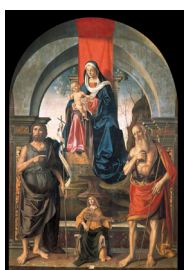
Restored by the Michigan Patrons, Madonna and Child with Sts. John the Baptist and Jerome by Marco Palmezzano, hangs in the Vatican Painting Gallery.

This event is an exclusive sneak peek into the cathedral's developing pilgrimage, which is not yet available to the public. The evening includes Mass and a strolling dinner, plus a chance to glimpse our magnificent apostolic statues, and spend some intimate time with these saints through related reflective offerings and personal encounters with their relics.