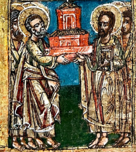
СОБОРЪЛЪ ФИЦИ ЛОРЪ АПОСТОЛЪ