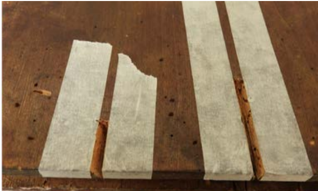
CUNEI SPACE PREPARATION