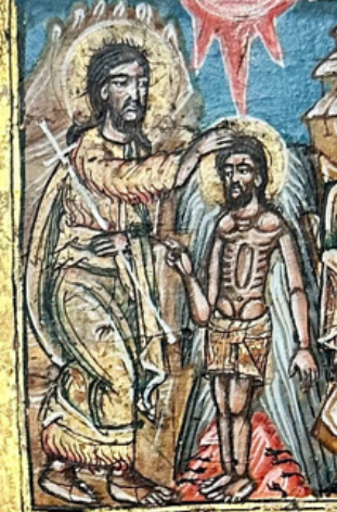
ТРИЕРА ХИ ИС Х