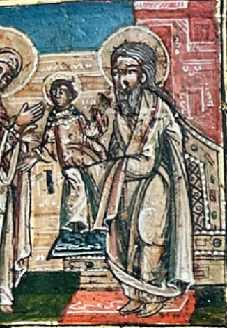
КА ФЛОРИ ЛОРЪЛЪ И ХС