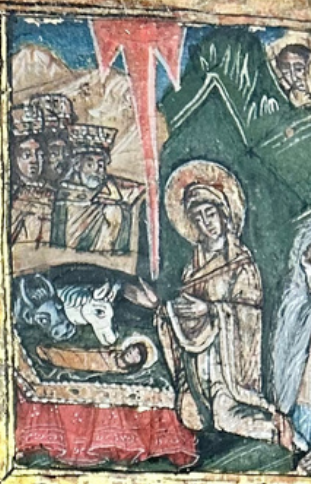
БС... Д... А...