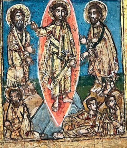
СВИМЪРА ЛЕФА ДИНА И ХС