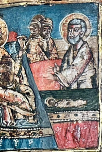
ЛПННАРА МЛЪХИ ХС