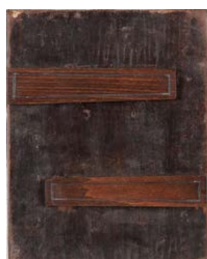
MODIFICATION OF THE WOODEN BOX