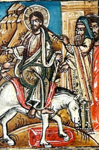
ЦИРА ДИНА ХИ И ХС