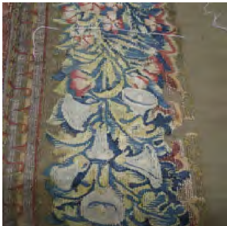
Same portion of tapestry before and after consolidation in alternating stitches.