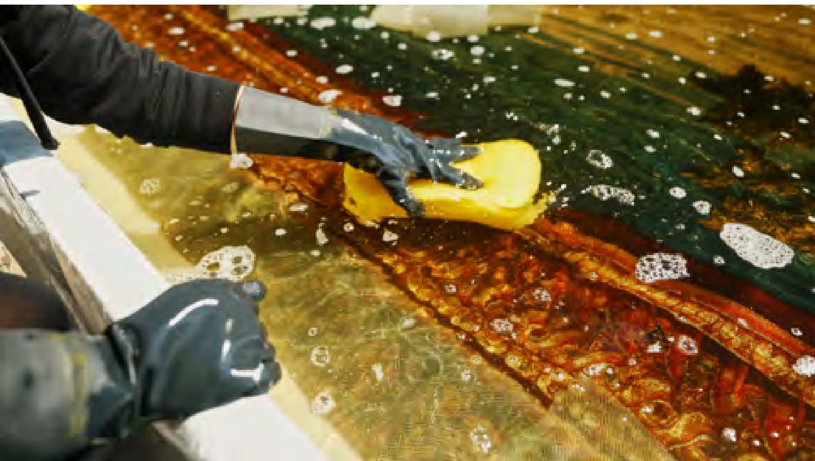
Sponging phase to remove impurities