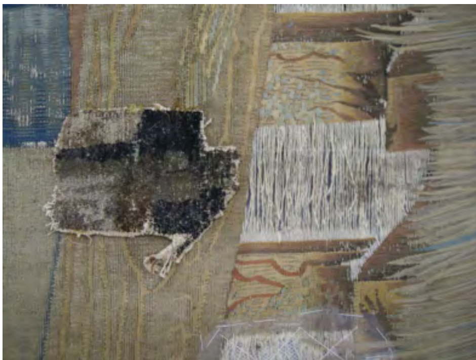
Two areas from which a previous restoration was removed