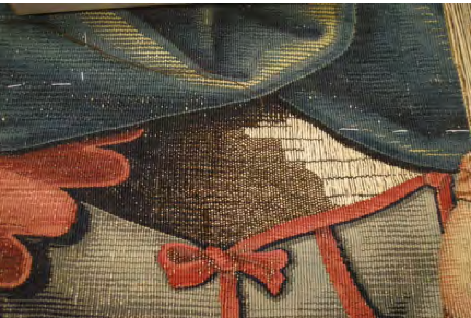
Same portion of tapestry before and after consolidation in alternating stitches