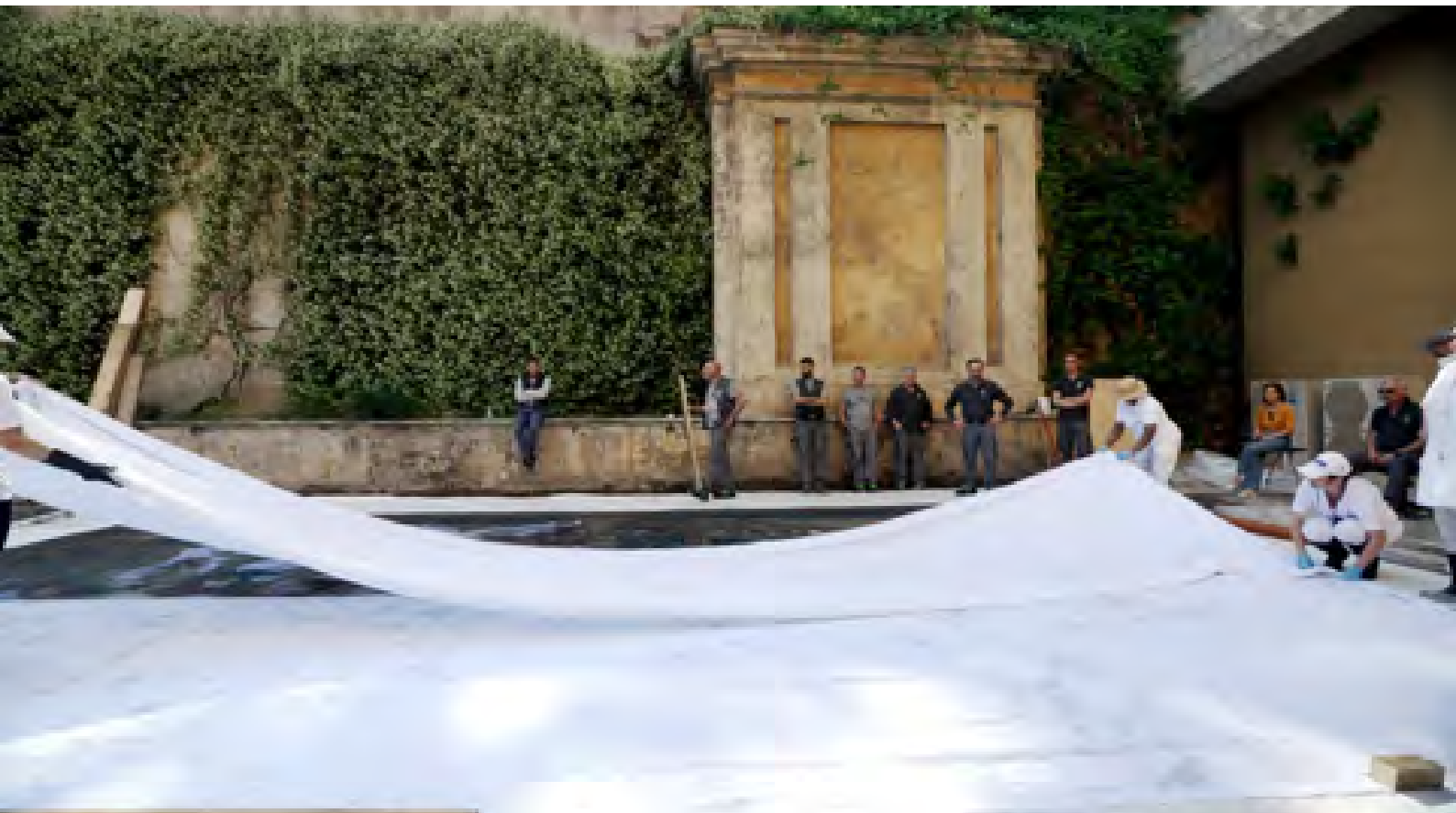
Absorption of excess water with cotton fabrics