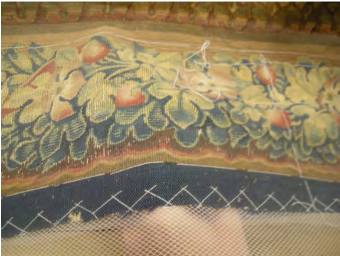
Fastening on heat-sealed mesh, removed after washing