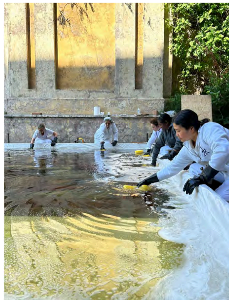
The tapestry has been washed in a specially constructed washing tank