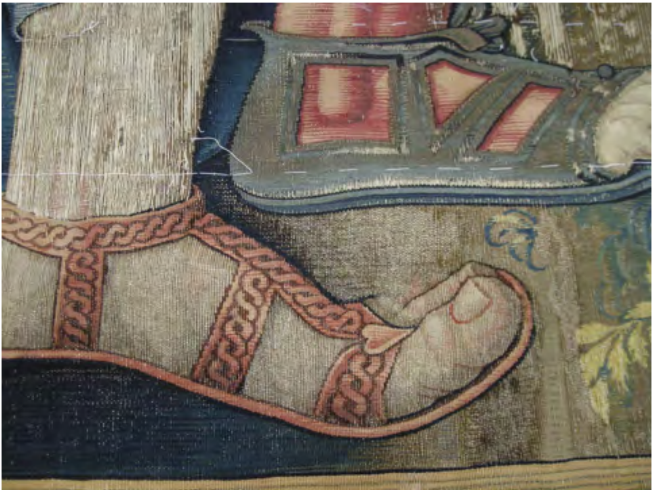
Same portion of tapestry before and after consolidation in alternating stitches