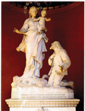
The image in the masthead above is from the Vatican Gardens – Madonna della Guardia, restored by MI-PAVM.

From the Michigan Chapter of the Patrons of the Arts in the Vatican Museums